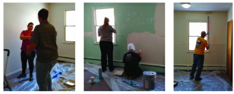
Volunteers painting new DBC office space

Effective on November 1, the DBC office has moved to an office suite at the Hills of Grace Church, 330 E. Anamosa Street, in Rapid City.